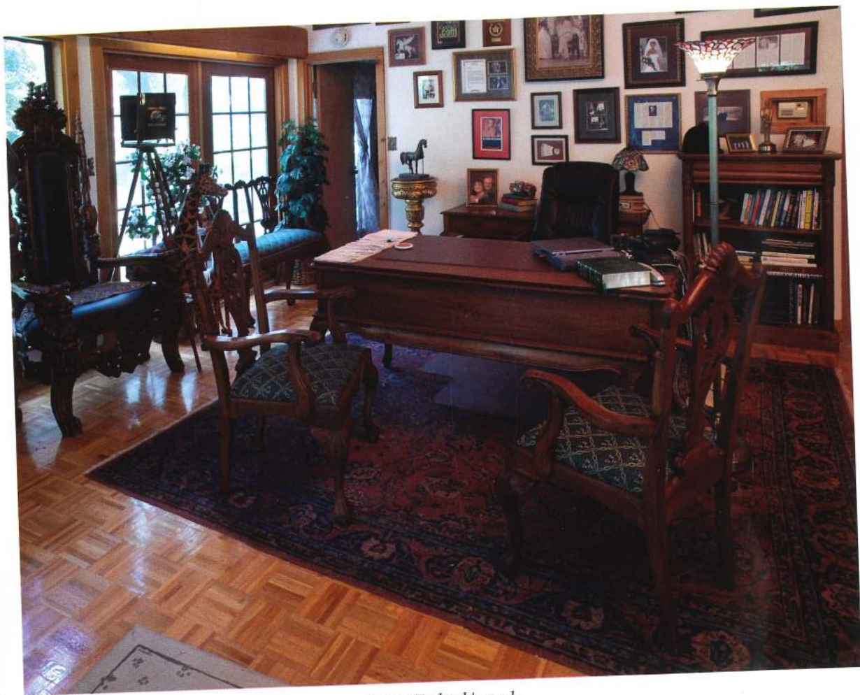
Steve Zadrick's study.

pound is a cluster of guest accommodations, and the manager's compound has its own privacy. Off to a side, the Zadricks' horses and cows mow the meadow, and a floodlit riding arena borders a pasture.